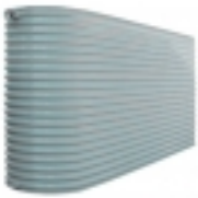
Slimline 2100 L