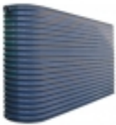
Super Slimline 2100 L

Width- 850mm Length- 1900mm Height- 1550mm [Product Details...]