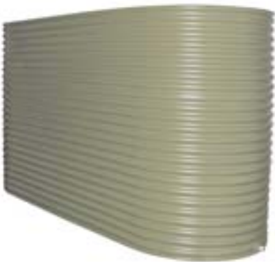
Slimline 5000L Call for Pricing

Width- 1150mm Length- 3250mm Height- 1550mm [Product Details...]