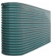
Slimline 3000 L

Width- 550mm Length- 2800mm Height- 1550mm [Product Details...]